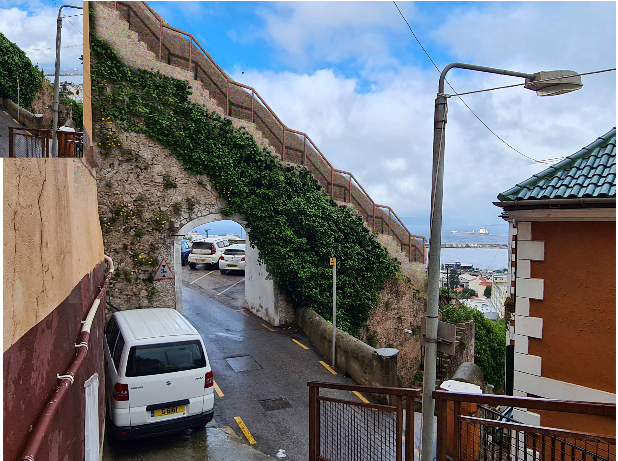
VISUAL 1 - CHARLES V WALL ACCESS