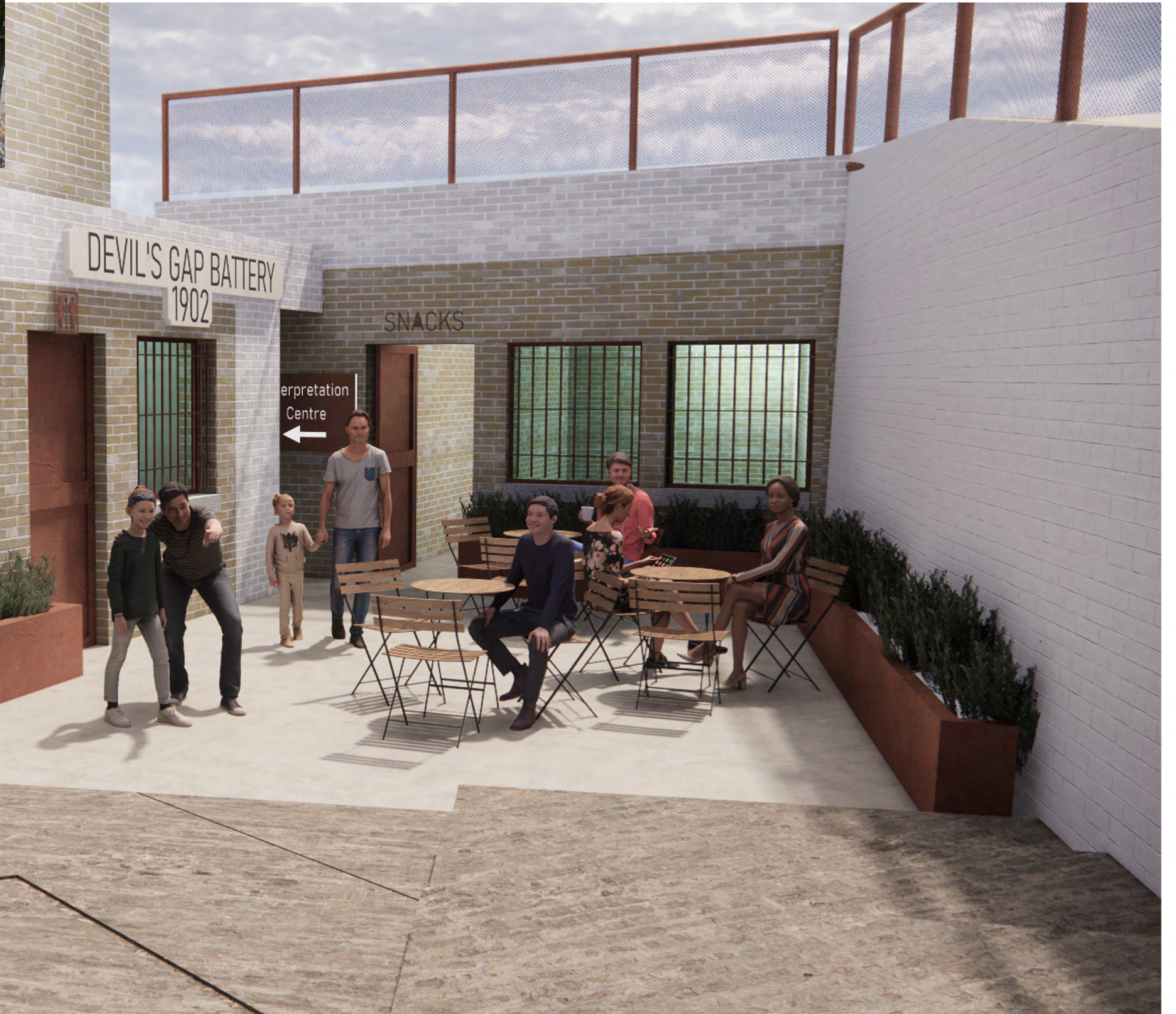
VISUAL 3 - DEVIL'S GAP BATTERY VISITOR CENTRE