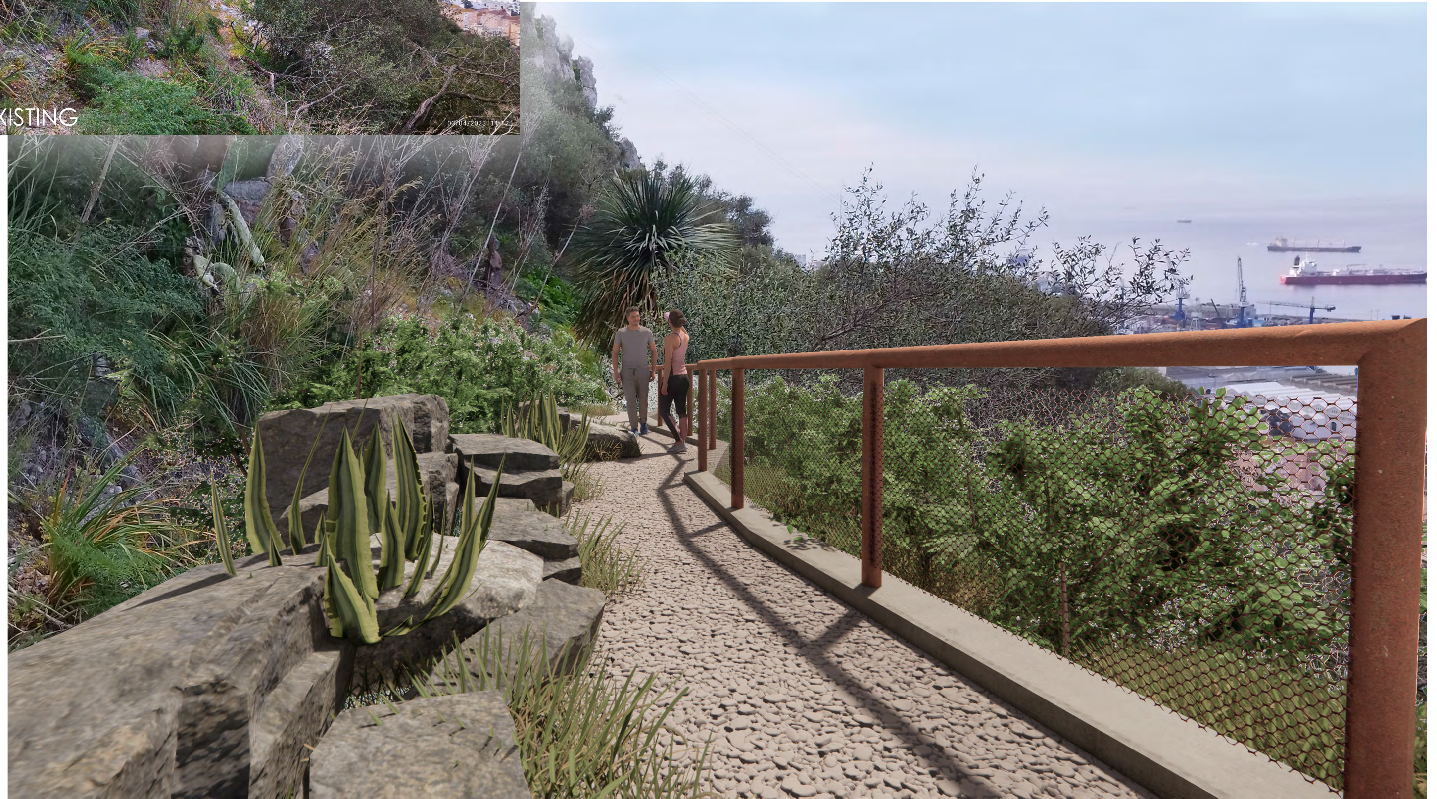
VISUAL 2 - TRAIN FROM GREEN LANE TO CHARLES V WALL