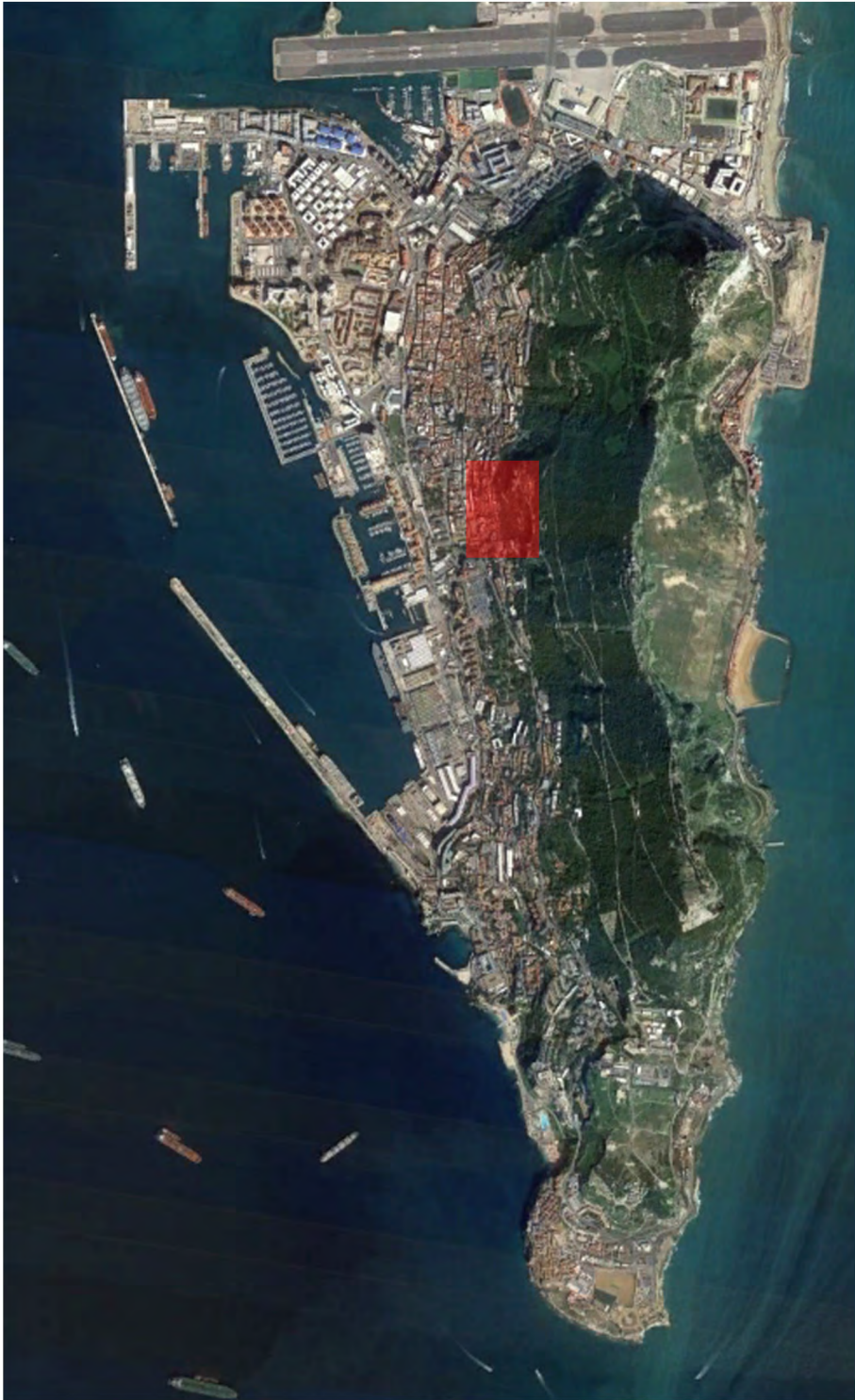
LOCATION & ROUTE