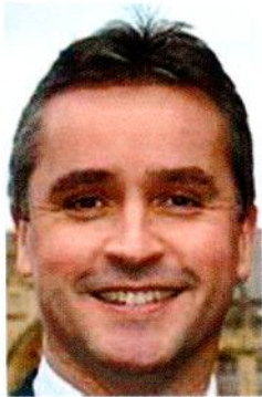
Mr Angus MacNeil MP SNP

In March 2006, MacNeil came to widespread public attention after lodging a formal complaint with the Metropolitan Police regarding the Labour Party Cash for Peerages scandal. In April 2006, he and former "anti-corruption" MP Martin Bell wrote to Prime Minister, Tony Blair calling for all appointments to the House of Lords to be suspended in the wake of the scandal. In November 2006 he won the Best Scot at Westminster section of the Scottish Politician of the Year awards for instigating the inquiry into possible abuse of the honours system. He also received awards from the Spectator Magazine and the Political Studies Society for setting the political agenda in Britain during 2006. He is a member of the editorial board for political monthly Total Politics . MacNeil was re-elected to Parliament in 2010.